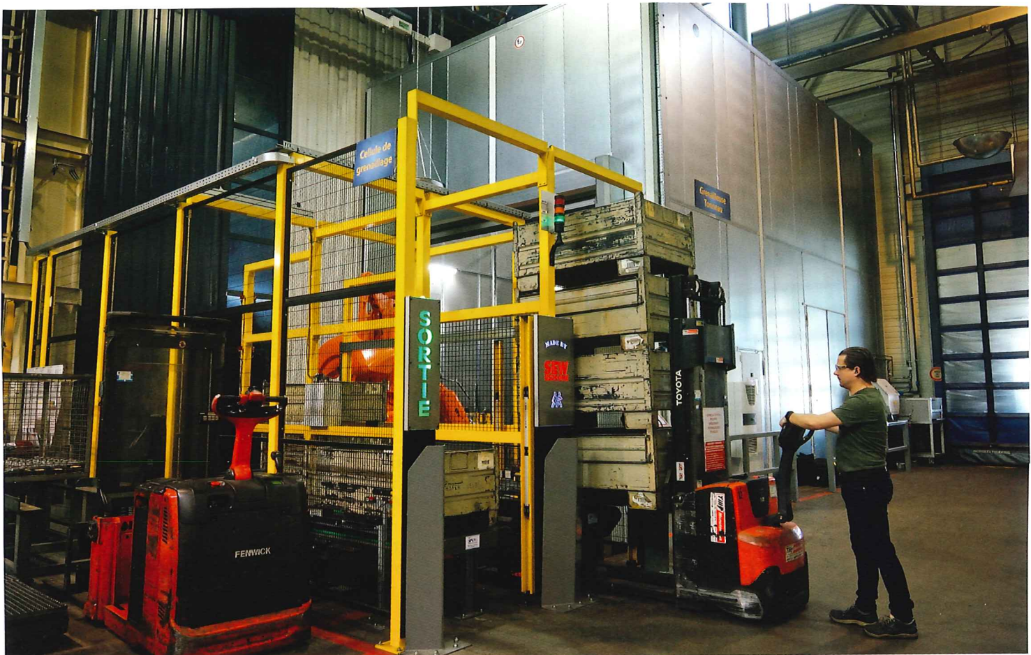
Delivery of new workpiece boxes to the blasting cell.