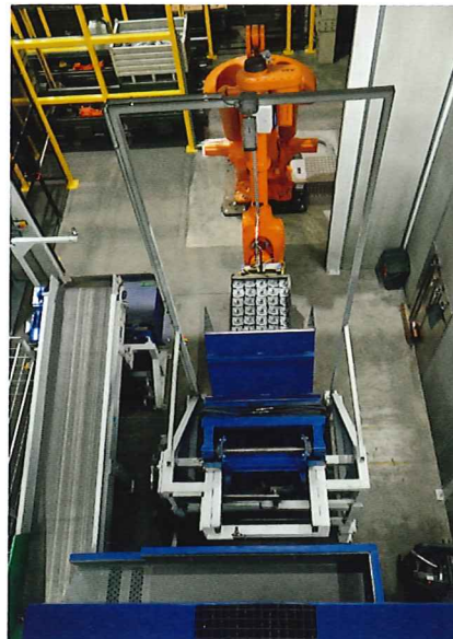
Plan view of the blasting cell.

During planning, an idea matured with regard to time integration of the new machine in the process. The storage between casting and blasting was to be avoided, which entailed designing the machine so that it could blast quicker than new parts emerge from production. "Employees were to be relieved of tasks that do not directly add value to the workpieces", says Romain Zorzi, Project Manager for New Processes.