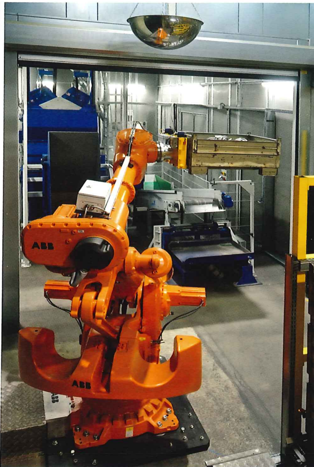
View of the blasting cell, with robot, blasting machine and conveyors.