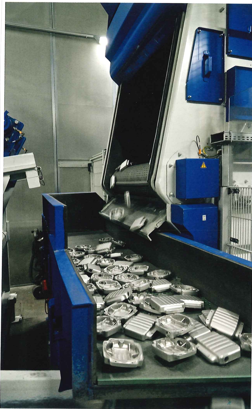
Workpiece feeding channel after the blasting process.

ting parameters were determined through testing.