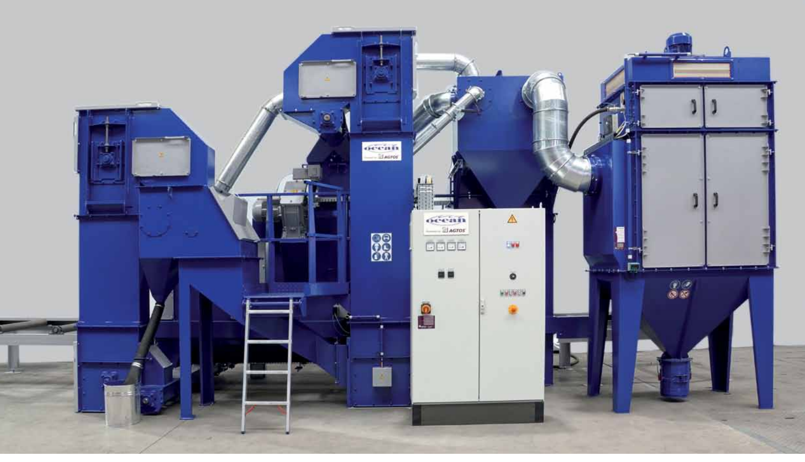
The side view illustrates the compact design of the "Ocean Blaster".

After a demand became apparent for shot blasting machines also in smaller businesses of the steel industry, AGTOS reacted in cooperation with its partner Ocean Machinery Inc. by developing a machine that caters to this demand. The goal was to design a roller conveyor shot blasting machine for the operation in small shops often with low ceilings. The "Ocean Blaster" meets this and also further criteria.