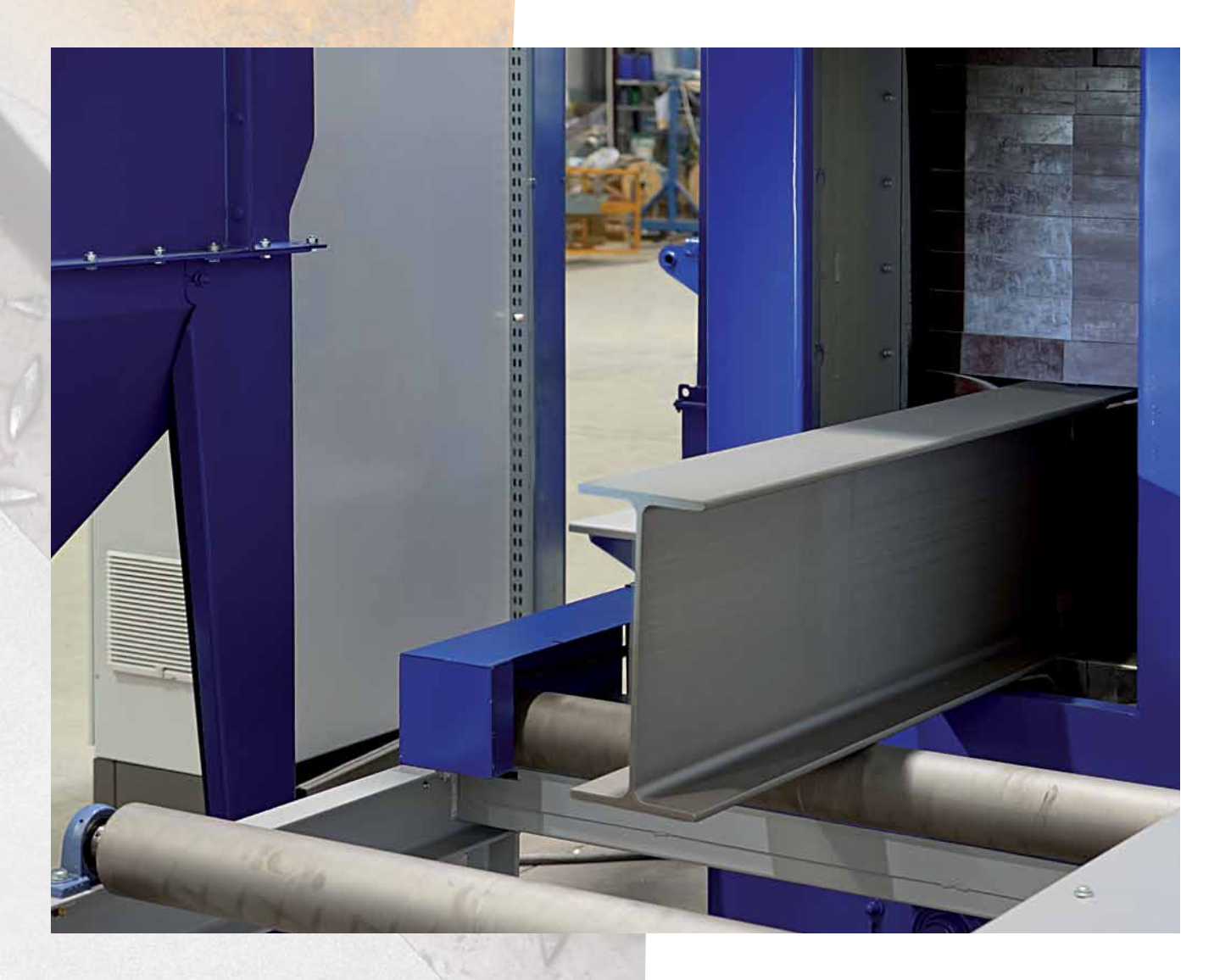
A Compact Shot Blasting Machine For Work Piece Dimensions of (W x H) 500 x 1.000 mm