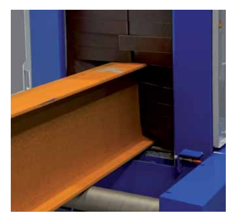
Perfect sealing of the inlet