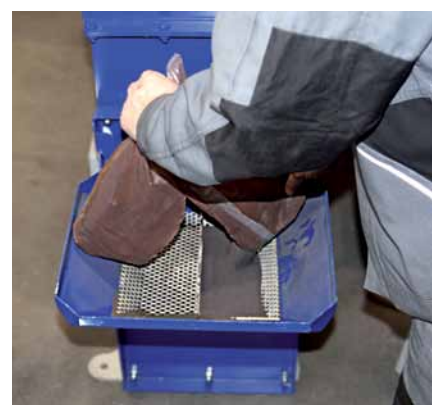
Convenient refilling hopper for the abrasive