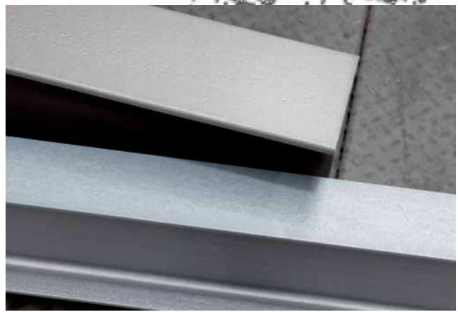
...and after the processing.