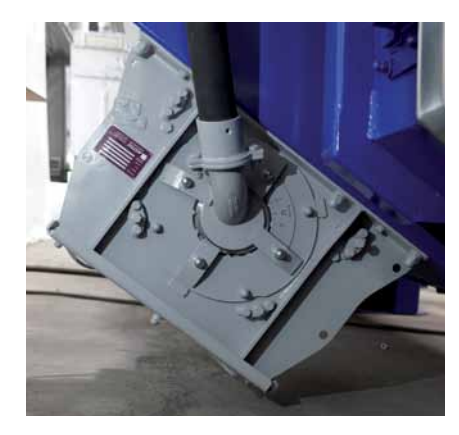
AGTOS High-performance turbine