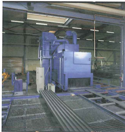
AGTOS roller conveyor shotblasting machine for rolled sections

The filter system sets new standards and contributes essentially to the reliability