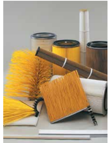
In addition to turbine parts, we also provide filter cartridges, new dedusting and sealing brushes and customized rubber and manganese blanks for several types of machines.

Quick processing of your orders and a smooth transfer to the warehouse ensures fast and professional shipment of ordered items.