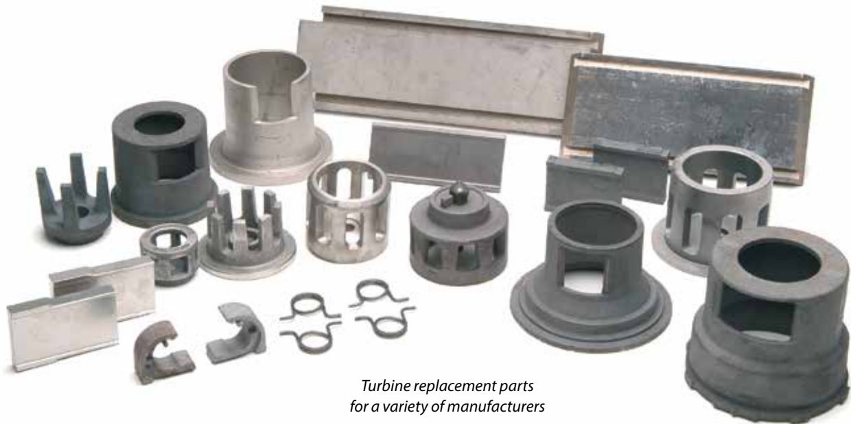
Turbine replacement parts for a variety of manufacturers