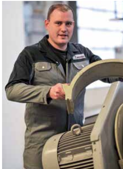
Professional blasting machine maintenance and repair

Learn more about the AGTOS service concept.